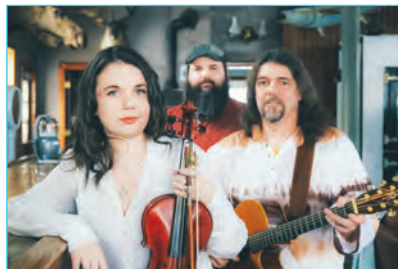
Blame Not the Bard

Blame Not the Bard. Blame Not the Bard is on a mission: to bring the stories of Ireland alive...and to have fun doing it. Described as "Iowa Raised, Ireland Rooted," Blame Not the Bard is a high-energy trio determined to get your feet moving and hands clapping. With equal measures of instrumental prowess and historical knowledge, Blame Not the Bard entertains audiences with songs, stories, jigs and reels. Armed with Irish song, stories, and fiddling, Blame Not the Bard will bring you down-to-earth entertainment you won't soon forget! blamenotthebard.com