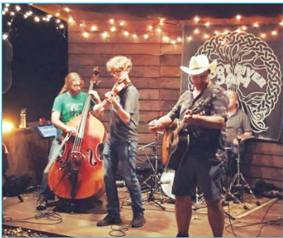
Root River Jam