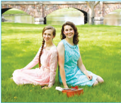
The SoDa Girls