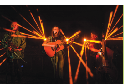
Mama Said String Band