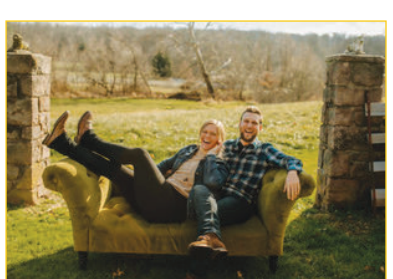
The Rough & Tumble