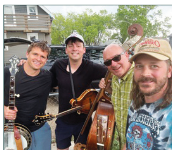
DOUBLE-O FORTY FOURS