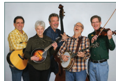
THE TOASTED PONIES

THE TOASTED PONIES. The Toasted Ponies combine the best of both traditional and contemporary Bluegrass music. Look for great harmony singing and hot instrumentals in a typical Ponies performance. These musicians are seasoned professionals who love playing their music and it shows. They will play everyone's Bluegrass favorites along with a fun mix of Cajun, Western Swing, Gospel and Celtic tunes just to keep things interesting. The Ponies are equally at home on a formal concert stage or at a barn party, county fair or community picnic. Just try seeing the Ponies show without tapping your toes — it can't be done!